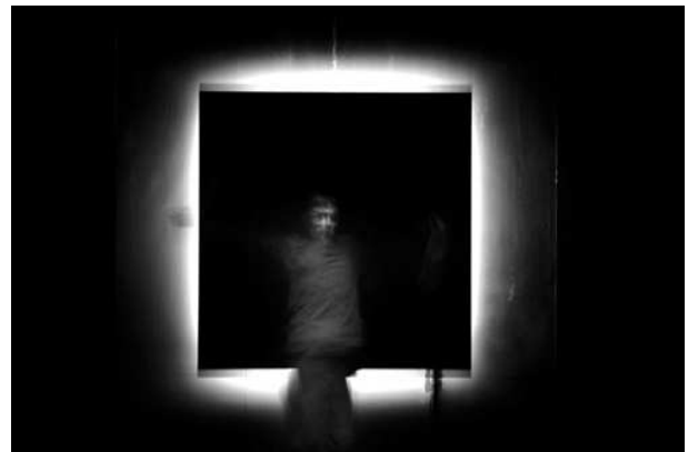
Figure 1: The dancer, Michael Schumacher, in front of the wall object during the performance of Schwelle in Berlin.

Copyright 2007 Copyright remains with the author(s).