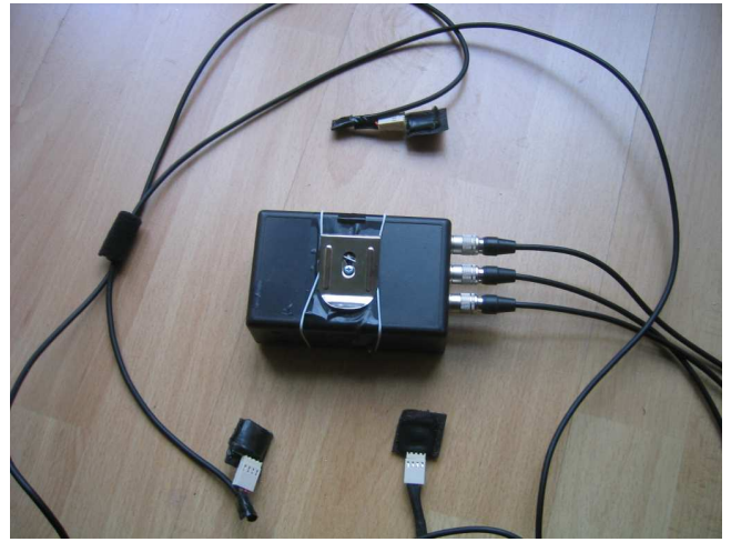
Figure 3: The bodypack, the dancer is wearing. The box is attached to a belt on the waist with the clip. The cables are fixed to his body at certain crucial points (on the chest, on the shoulders and near the elbow) to ensure that the cables stay close to the body, yet have enough slack to move with the body.